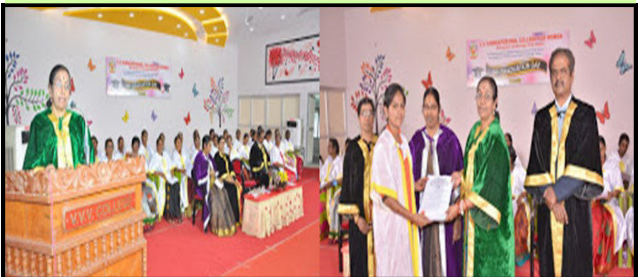
44 th Graduation Day Address was given by Hon'ble Vice-Chancellor of Mother Teresa Women's University, Kodaikanal at V.V.Vanniaperumal College for Women, Virudhunagar.