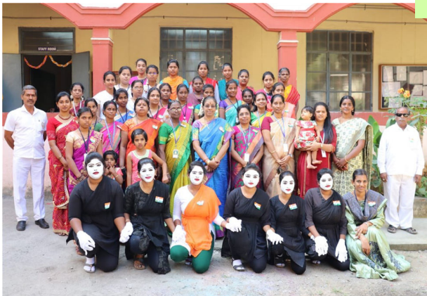
At Chennai Campus