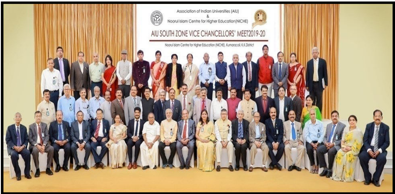
Hon'ble Vice-Chancellor at the Association of Indian Universities (AIU) Vice-Chancellors' Meet 2019-2020 at Noorul Islam Centre for Higher Education (NICHE), Kumaracoil, Kanyakumari District