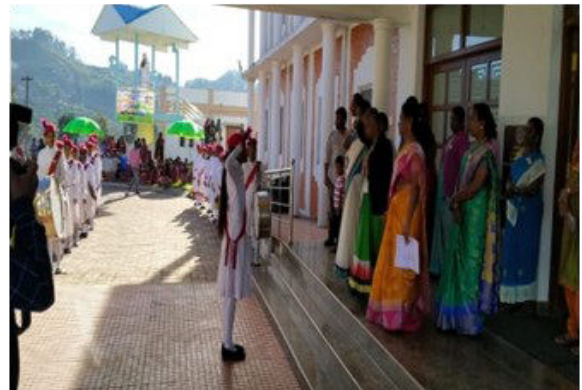
At Kodaikanal Campus