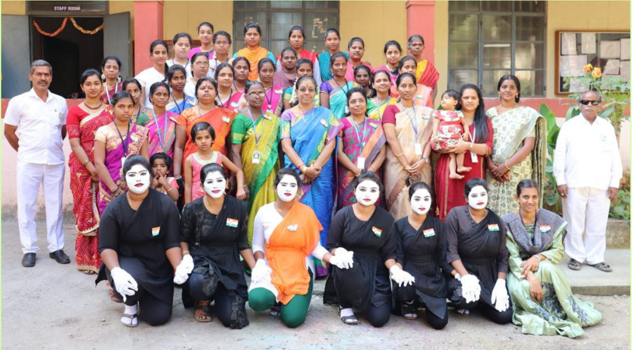
Hon'ble Vice-Chancellor hoisted the National flag and delivered the 71st Republic Day message at Mother Teresa Women's University Research & Extension Centre, Saidapet, Chennai.