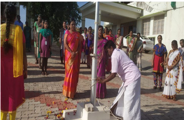
At Madurai Campus